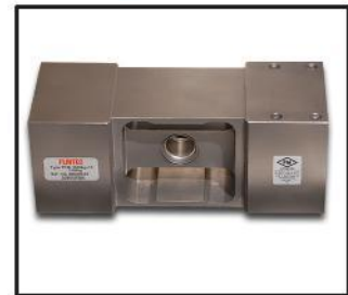
Hermetically sealed stainless steel load cell.