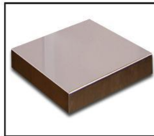
Stainless steel cover for harsh environments and corrosive materials.