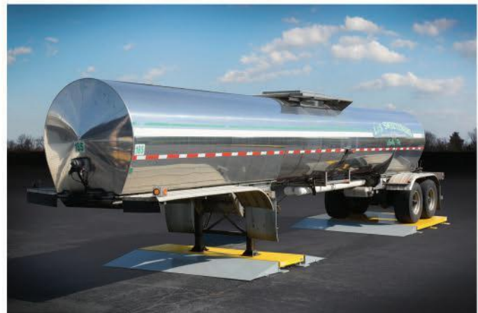
Model 770-AW, 770-AW-LG and 770-AW ramps shown in a typical tractor trailer/tanker configuration.