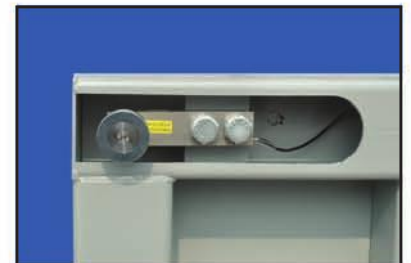
Self checking captive ball leveling feet.