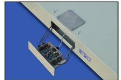
Easy access to side mounted polycarbonate NEMA 4x junction box.