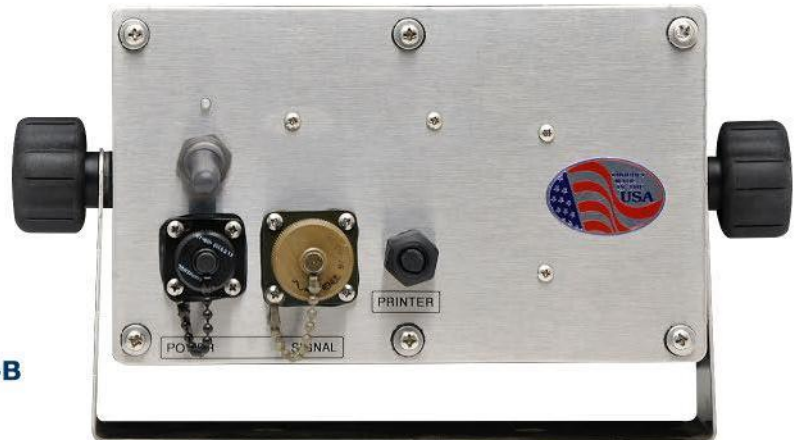
Cambridge Model SSCSW-10AT-B

Contact Cambridge for Additional Options