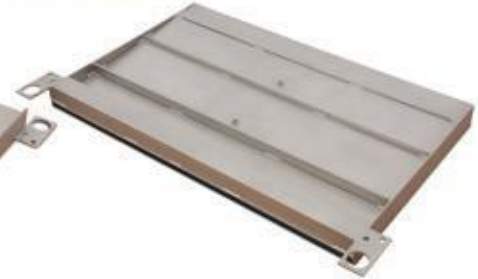
Model SS680 ramp underside

Model SS680 features optional easy incline ramps.