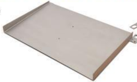
Model SS680 ramp

Model SS680 features easy access, anti-skid leveling feet.