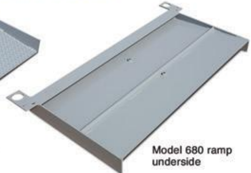
Model 680 ramp underside

Model 680 features optional easy incline ramps.