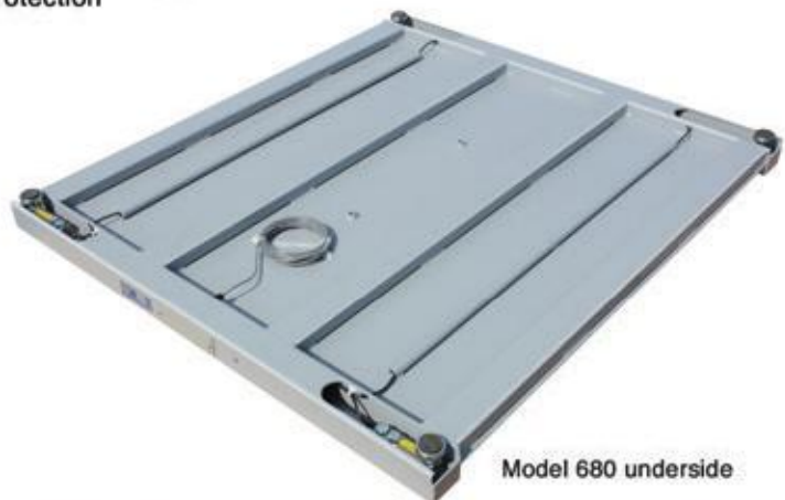
Model 680 underside