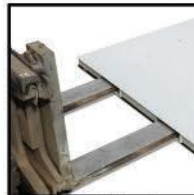
Fork lift skid package