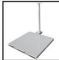
Attached indicator column