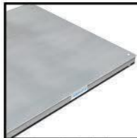
Smooth deck plate