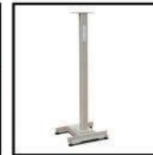
48" Indicator column (Freestanding)