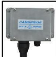
Remote Stainless Steel NEMA 4X junction box