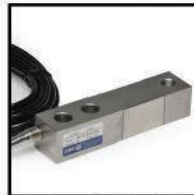
SS, hermetically sealed and/or "FM" approved load cells