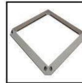
Bumper guard surround