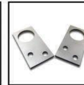
Lag down brackets (sold individually)