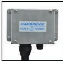
Remote stainless steel NEMA 4X junction box