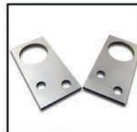
Lag down bracket (sold individually)