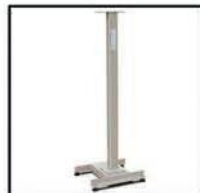
48" Indicator column (Free standing)