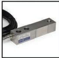
Hermetically sealed and/or "FM" approved load cells

Model SS660-PW Stainless steel construction with standard stainless steel NEMA 4X junction box.