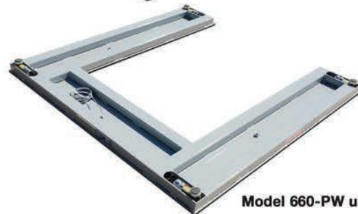
Model 660-PW underside