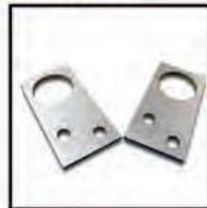
Lag down brackets* (sold individually)