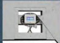
Top access junction box