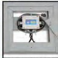
SS on-board NEMA 4X junction box AL660 "Classic" only