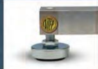
Standard leveling feet