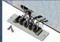
Side access junction board