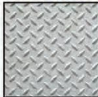
Glass bead finish