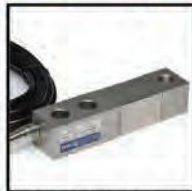
SS, hermetically sealed and/or "FM" approved load cells