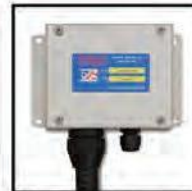
Remote stainless steel NEMA 4X junction box