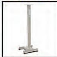
48" Indicator column* (Freestanding)