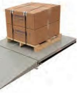
Model AL660 "Classic" series aluminum low profile floor scale shown with optional easy incline ramp.