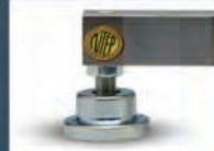
Captive ball leveling feet