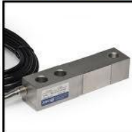
SS, hermetically sealed and/or "FM" approved load cells