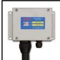
Remote stainless steel NEMA 4X junction box