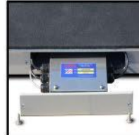
SS on-board junction box