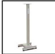
48" Indicator column* (Freestanding)