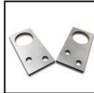
Lag down brackets* (sold individually)