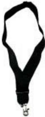
Wrist Strap (Raymote®) #8035-1050