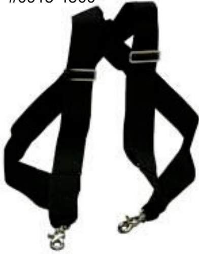
3-point Harness #0800-0290