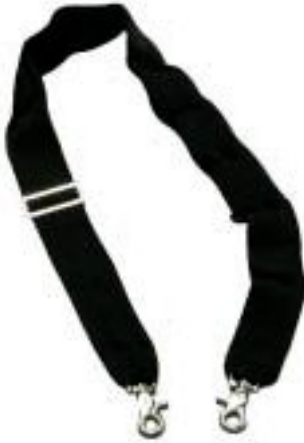
Raymote® Holster #0800-0660